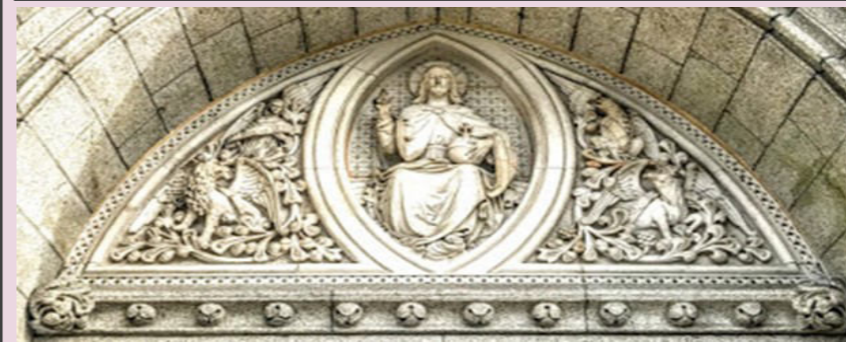
A figure above the west door shows Christ the King in blessing, surrounded by figures representing the four Evangelists