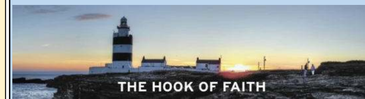
THE HOOK OF FAITH