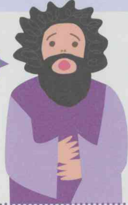
This is a friend of Jesus who is worried about him leaving.

Jesus says he has to leave his friends, but he is sending a special helper to be with them. Jesus is sending the Holy Spirit. No one needs to be worried or afraid, Jesus is giving us all his peace.