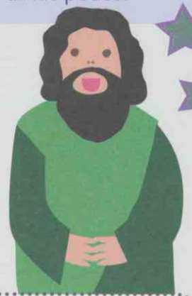
Here he is when Jesus promised to send a helper.