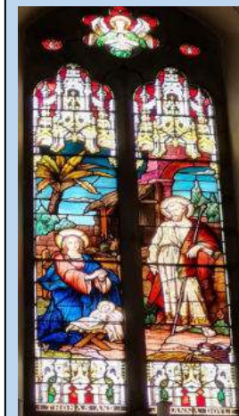
3. The Nativity of Our Lord