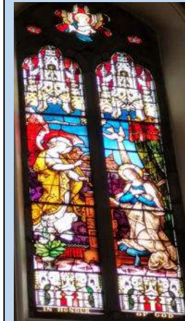
1. The Annunciation

Walk back in time.... St. Mary & St. Michael Parish Church New Ross 1902—2022 Celebrating 120 Yrs in September 2022 Stained Glass Windows Lest we forget