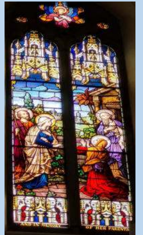
2. The Visitation