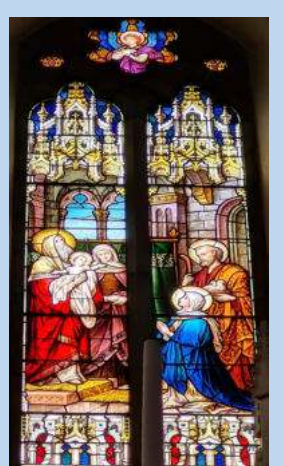
4. The Presentation