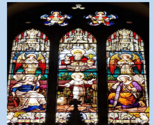
In Thanksgiving for their generosity these people will be included in the Parish Mass Association

We are seeking people to volunteer for the ministries' both Readers & Eucharistic Ministers in our Parish Church especially for weekends. If you are interested in applying please contact the parish office.