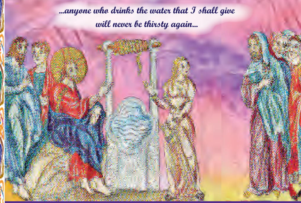
...anyone who drinks the water that I shall give will never be thirsty again...

There is a thirst for the love, joy and meaning of the gospel in the hearts of our people today. It is sometimes ignored in the rush of modern consumerism. The readings today invite us to bring that deep thirst for life to Jesus and his gospel.