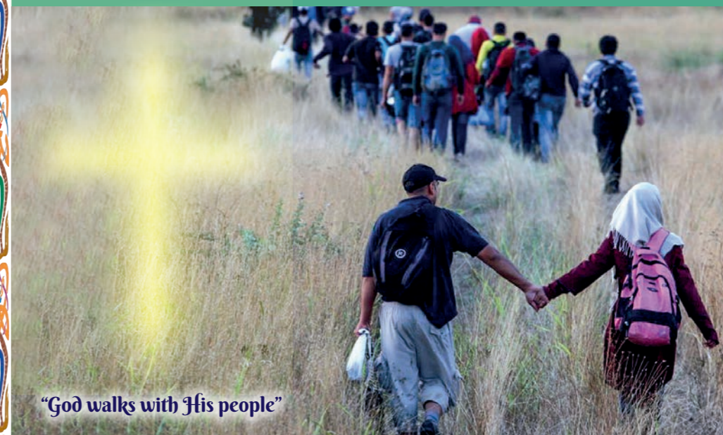
"God walks with His people"

The word of God cuts into our lives and challenges us to listen, even, if its message is tough. It is a word which promises a constant invitation in our lives to live more like Christ.